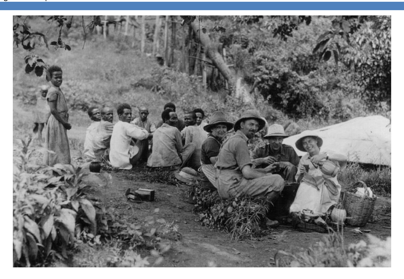
The first group of Hermannsburg Lutheran missionaries on the way to Aira, Wallagga, 1928

Anyhow - they were determined to go. They prepared mules and horses, made a contract with a trader and four of them started their journey together with a translator on June 11: There were no ways - only a few paths for mules. After 20 days they reached Naqamte where they made contact with the governor who had let them to go on, and with the Swedish missionaries. They arrived at Aira on July 16, 1928. But with big losses: many mules died after passing the Dhidheesaa valley.