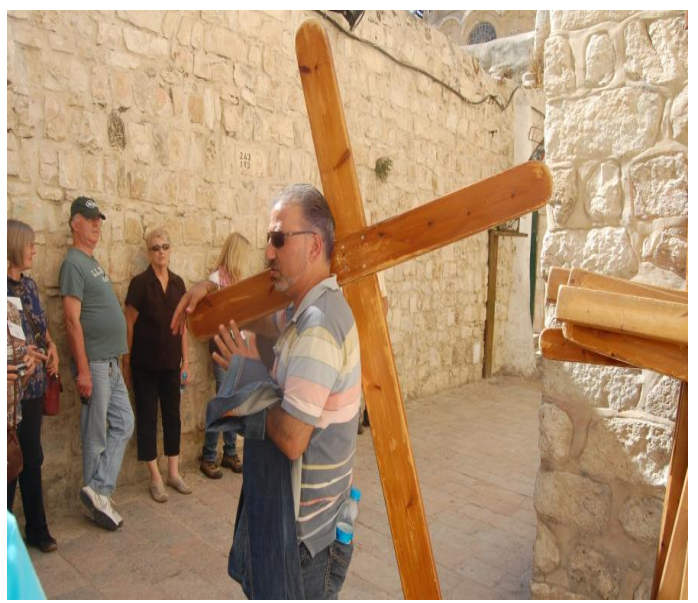
Please repeat the following prayers for yourself:

"madaa'uu isaatiinis fayyinni nuuf hin argame" lsa 53:5