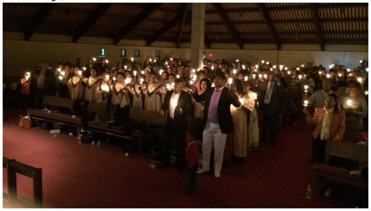
Close to midnight 31 December 2013-Saying good-by "nagaatti" to 2013 & welcoming 2014.

on peace ( nagaa ): Alli nagaa, manni nagaa, qe'een nagaa, maatiin nagaa, lafti nagaa, waaqni nagaa. Nagaa!