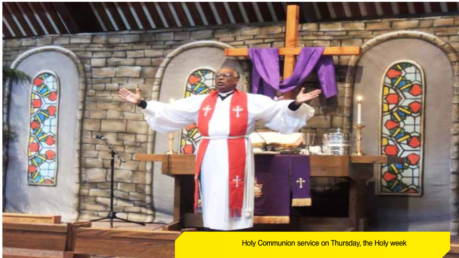
Holy Communion service on Thursday, the Holy week

Christmas is the celebration of the birth of Christ, the coming of the Expected One, the Messiah- God sending His only Son to earth on a mission. Easter is the celebration of the conclusion of Christ's mission to earth in triumph. Without Christ's resurrection from the dead His birth wouldn't have any more significance than that of the founders of the other major world religions. At best He would have been simply considered as one of them. So Easter is very important for Christians to remember, reflect on and celebrate His triumph, a sign of hope and affirmation for us to continue living with Him beyond this life; "the resurrection of the body and the life everlasting".