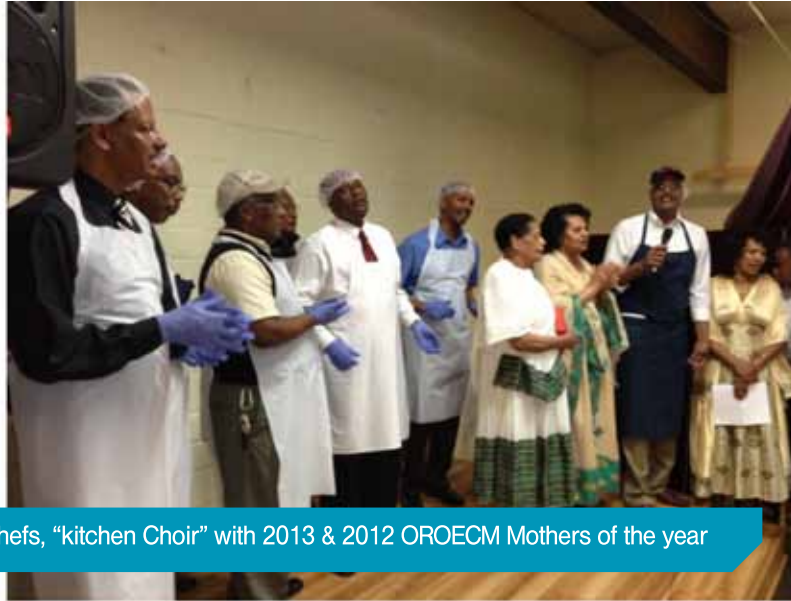
The Chefs, "kitchen Choir" with 2013 & 2012 OROECM Mothers of the year

The chefs as the master of the ceremony called them "the kitchen Choir" not only cooked delicious food but were also good at singing well- the favorite song of the day was, "Gararraa dhaa taliila robe".