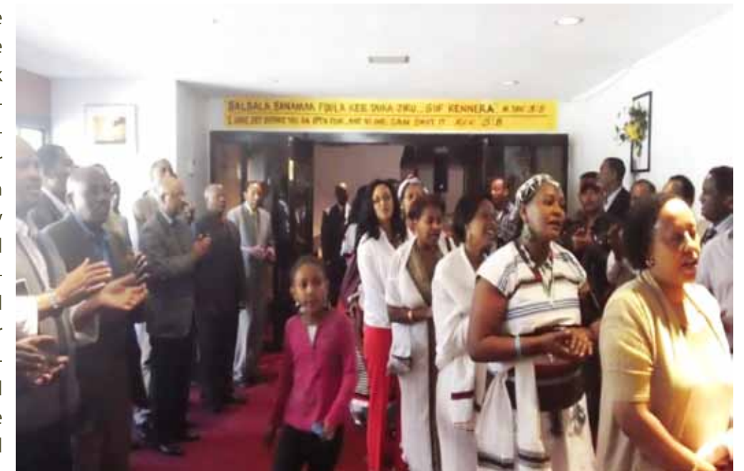
Mothers in procession from the sanctuary to Aster Gannoo Hall.

Proverbs 31: 29: "Many mothers, (women) have done excellently but the mothers of OROECM surpass them all". (Hadhotii baayyeetu wanta gaarii hojjetu, haadhotiin Waldaa Kiristiyaanaa Oromo Minnesota hunduma isaanii caaltu". Fakkenya 31:29.)