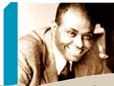
Rev. Gudina Tumsa