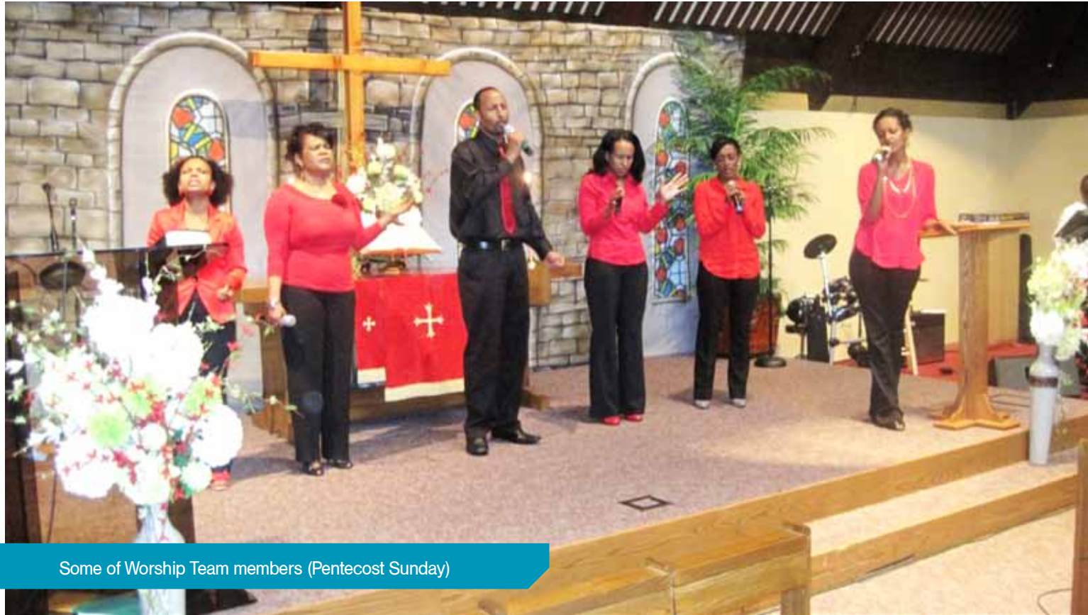
Some of Worship Team members (Pentecost Sunday)

The unexpected event of that day and the continued work of the Holy Spirit in the life of the Church thereafter were foretold in Joel 2:28. "In the last days, God says, I will pour out my Spirit on all people. Your sons and daughters will prophesy, your young men will see visions, your old men will dream dreams."