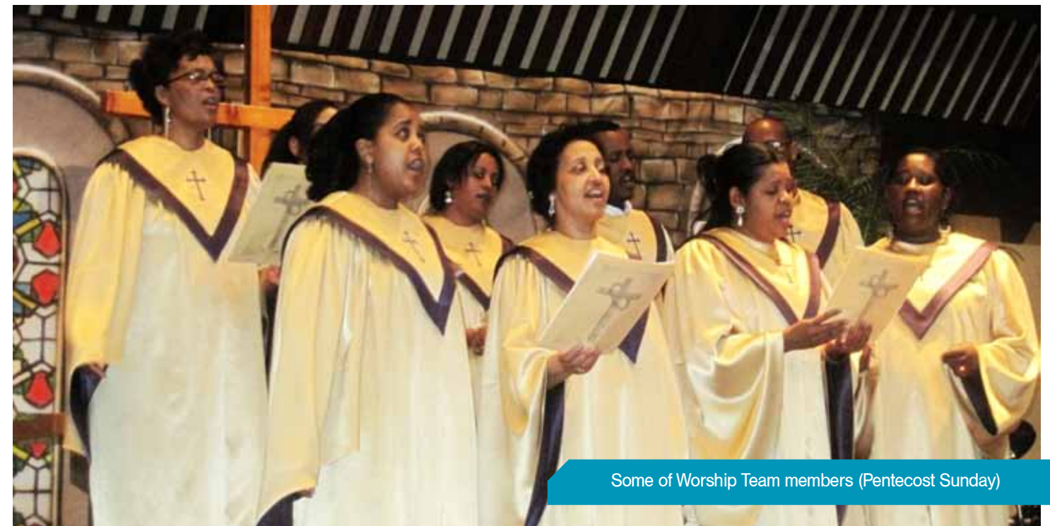
Some of Worship Team members (Pentecost Sunday)

used responsibly to strengthen the church spiritually and for the glory of God. The church should give attention to these 3 very important chapters in the New Testament and teach emphasizing that no one feels as having no gift of the Spirit and end up feeling less worth. No one should made feel unwelcomed and feel at the periphery but welcomed as part of the Body of Christ and encouraged to use his/her gift for His glory. In Ch. 13 Apostle Paul concludes by underlining that the most import gift of the Spirit to be love. Without love, void of love all of our other gifts that we claim to have come to nothing.