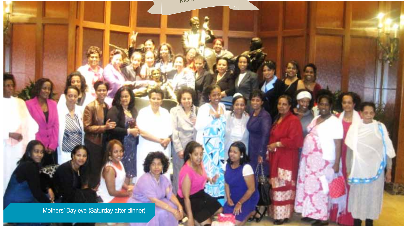
Mothers' Day eve (Saturday after dinner)