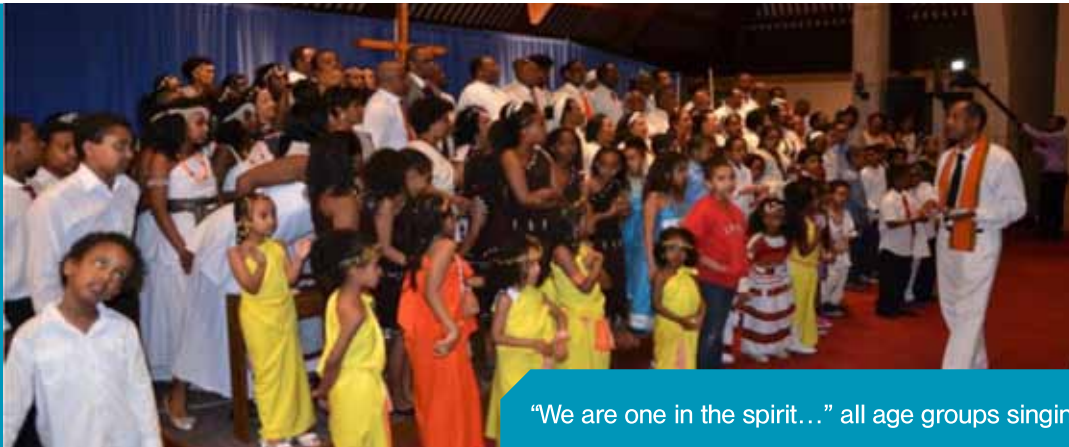
“We are one in the spirit...” all age groups singing together

According to Matt 6:33, Jesus said, “First seek the Kingdom of God and His righteousness, and all these things will be given to you.” It means, in whatever we do or wish to do if we put our trust in God wholeheartedly, we will be abundantly blessed. The Lord will take care of the rest of our needs; if we only have a little faith, the size of a mustard seed and trust and leave the rest to Him we do not have to really worry about anything. God knows our needs more than we do. Of course it does not mean that we do nothing but put our faith in Him and do our part.