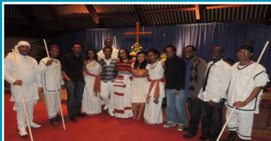
Musicians, worship leaders and some choir members in Oromo traditional dress.